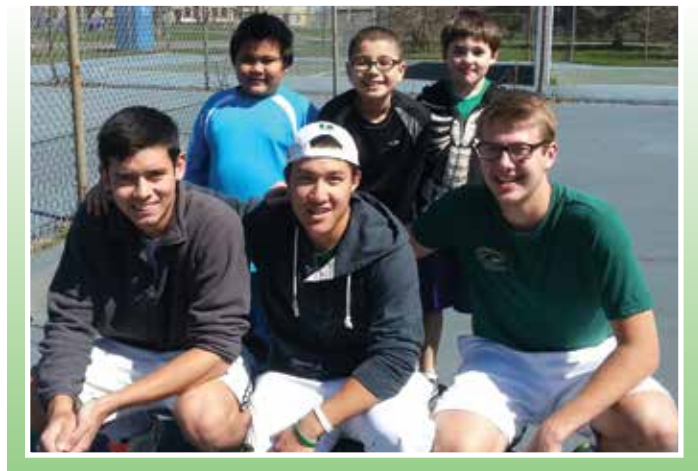
15-LOVE participants with members of Skidmore's Men's Tennis Team

With each college stop our participants were able to learn different tennis strategies and see how a college team truly works together. They also connected with many of the college athletes and took what they learned and applied it to their upcoming tennis matches.